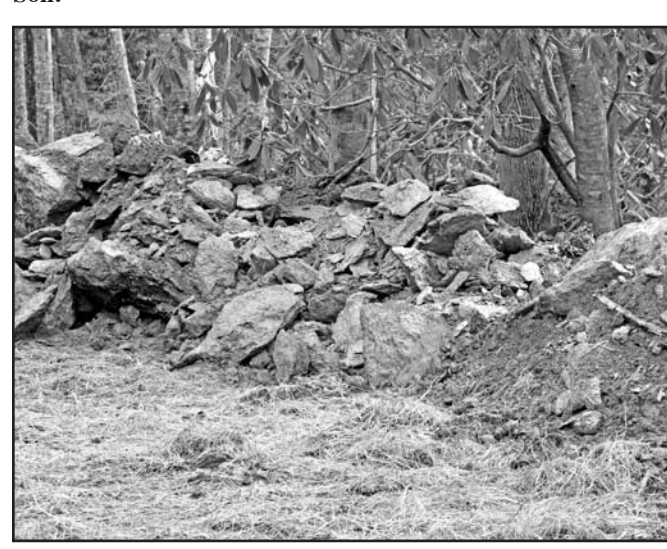
The boulder after being busted up by Anderson & Son.

When Anderson's crew finished busting the big boulder, they cleared the scene by pushing the fresh rubble well back from the far shoulder of the road, and the county reestablished thru-traffic on Owl Creek Road that Tuesday evening.